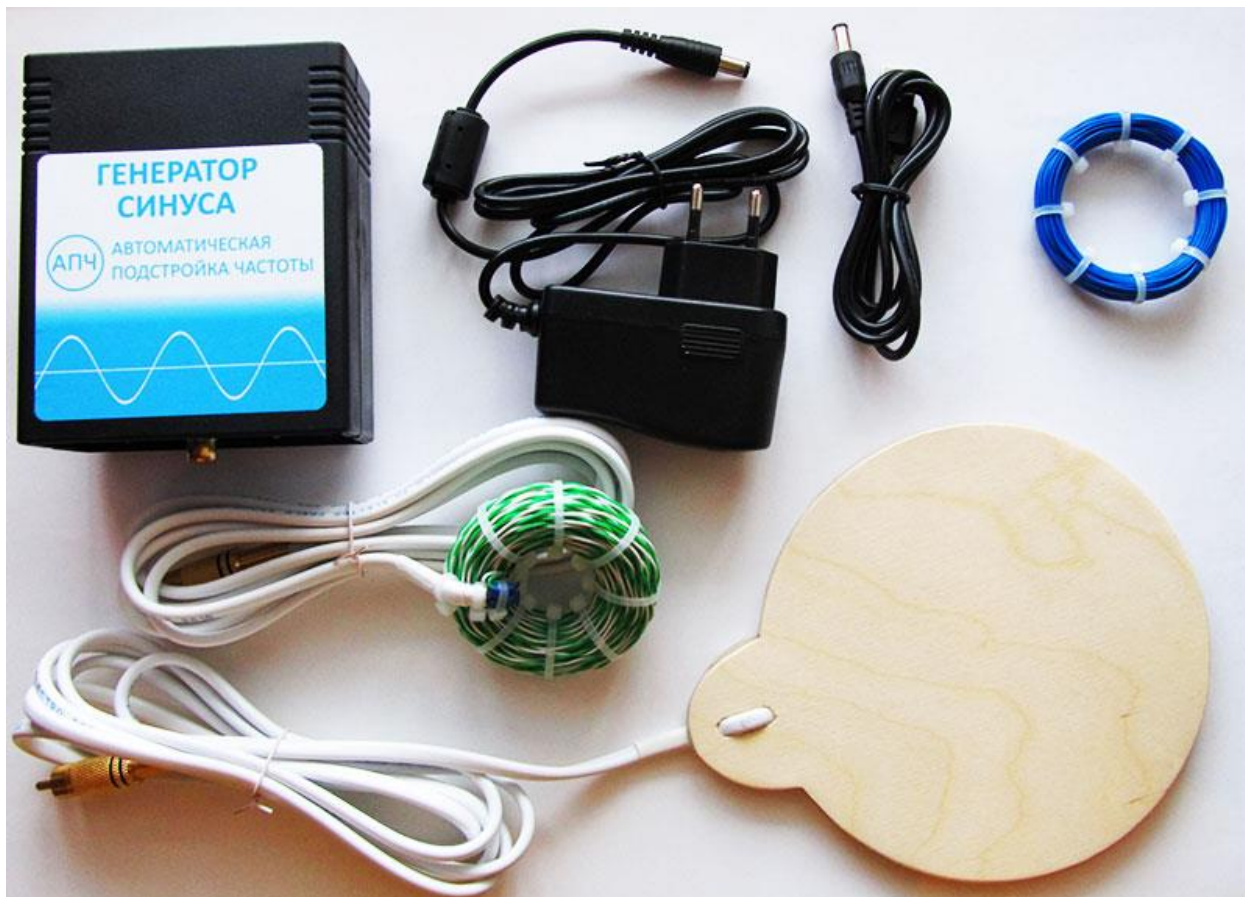
The complete set of Mishin Coil (Mishin generator)

The complete set (capacitive coils) includes: