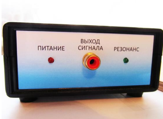
Picture 1. the sine autogenerator